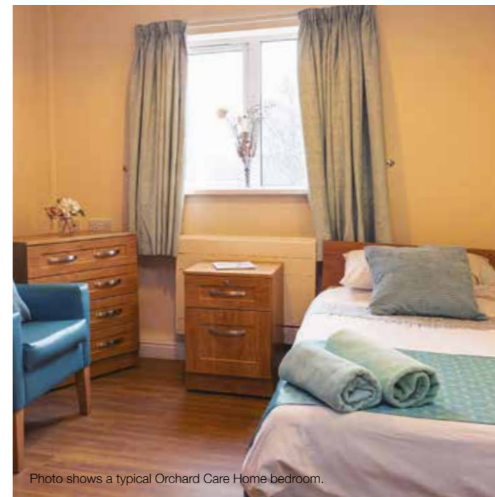
Photo shows a typical Orchard Care Home bedroom.