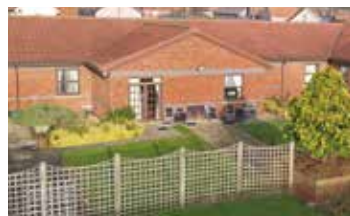
LANSBURY COURT Sunderland SR5 3DF Tel: 0191 549 3950