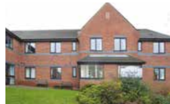
ASHLEA LODGE Sunderland SR4 7AB Tel: 0191 510 9405

If you would like a version of this brochure in large print please contact us.