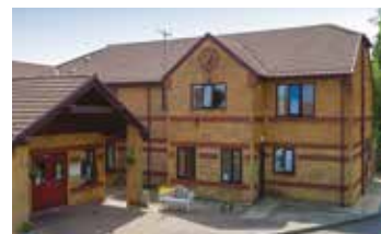
THREE BRIDGES Warrington WA4 1NT Tel: 01925 418059

“ THE STAFF ARE VERY FRIENDLY AND RELIABLE AND GREAT WITH MY DAD. EXCELLENT CARE AND A SPOTLESS CARE HOME. THE BEST ONE HE'S BEEN IN.