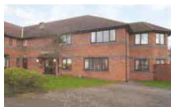
PADDOCK STILE MANOR Houghton-le-Spring DH4 4ES Tel: 0191 584 8159