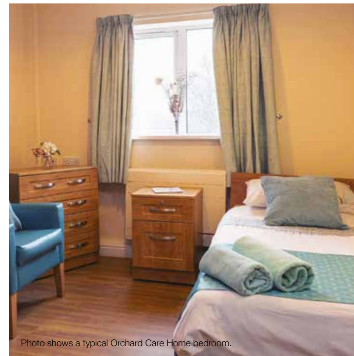
Photo shows a typical Orchard Care Home bedroom.