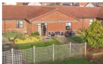
LANSBURY COURT Sunderland SR5 3DF Tel: 0191 549 3950