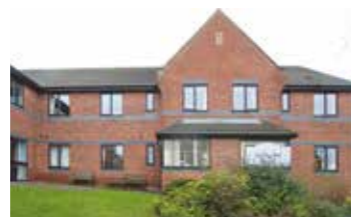
ASHLEA LODGE Sunderland SR4 7AB Tel: 0191 510 9405