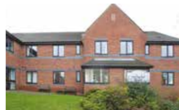
ASHLEA LODGE Sunderland SR4 7AB Tel: 0191 510 9405

If you would like a version of this brochure in large print please contact us.