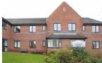
ASHLEA LODGE Sunderland SR4 7AB Tel: 0191 510 9405

If you would like a version of this brochure in large print please contact us.