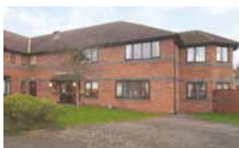
PADDOCK STILE MANOR Houghton-le-Spring DH4 4ES Tel: 0191 584 8159