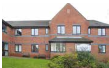
ASHLEA LODGE Sunderland SR4 7AB Tel: 0191 510 9405

If you would like a version of this brochure in large print please contact us.