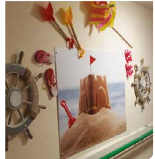
Examples of themed areas