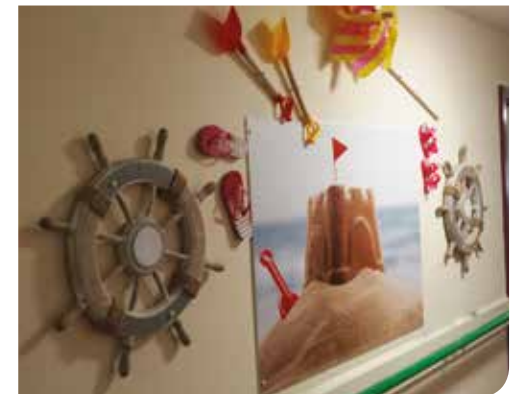
Examples of themed areas