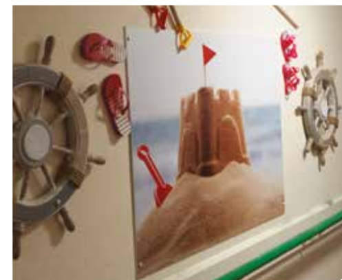
Examples of themed areas