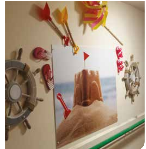
Examples of themed areas