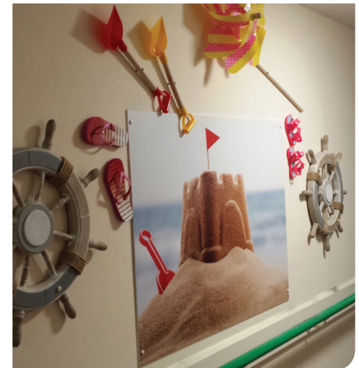
Examples of themed areas